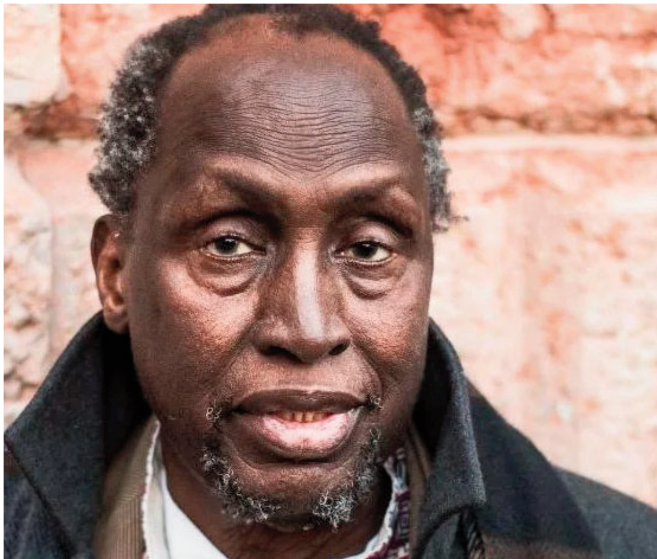
Ngũgĩ wa Thiong'o — died at age 87

He followed with The River Between and A Grain of Wheat , cementing his place as a powerful new voice in African storytelling. But it was in 1977 that Ngũgĩ would make a bold and irreversible pivot, rejecting colonial identity and embrac-