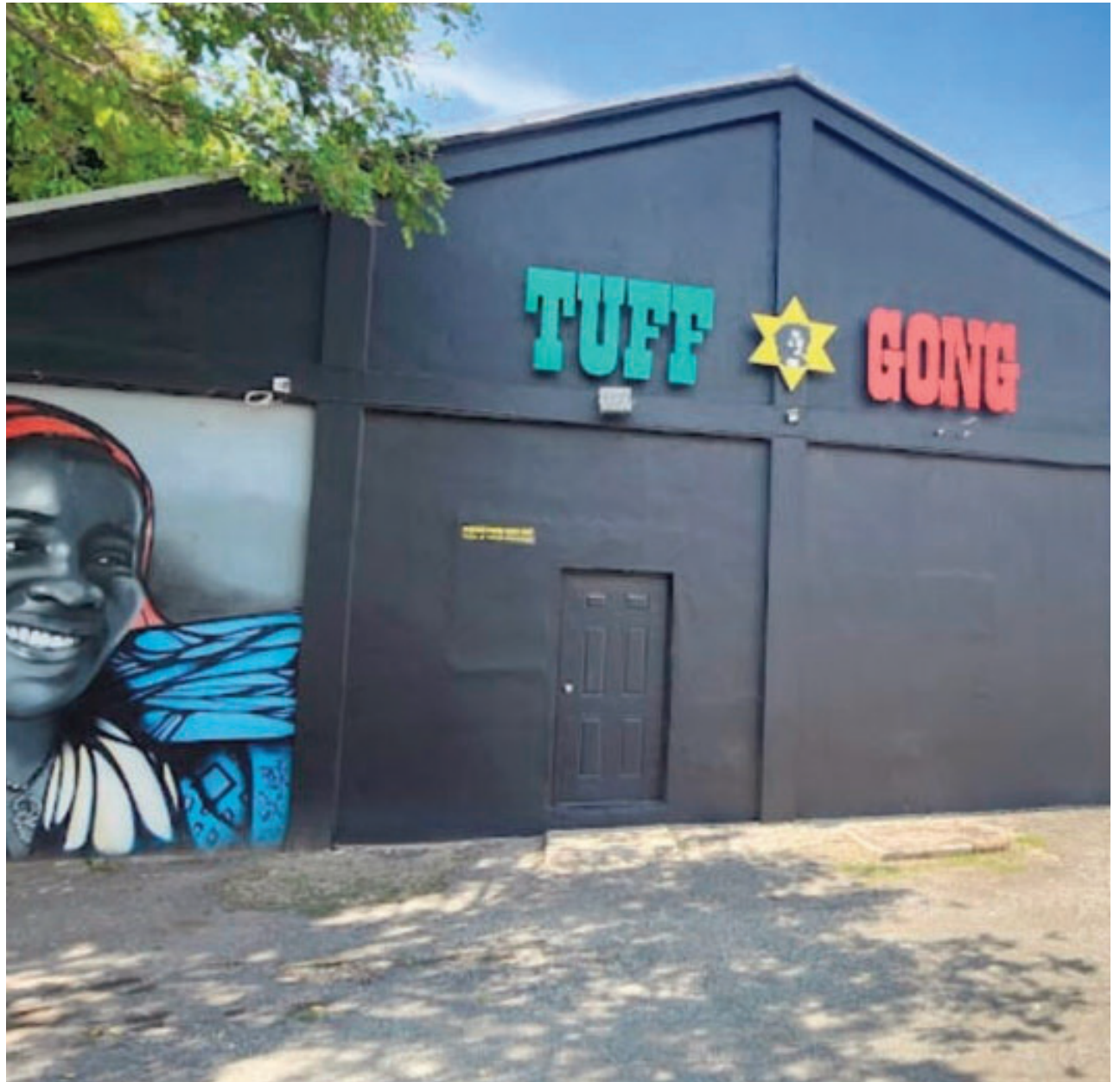
The Tuff Gong studios in Kingston, Jamaica

Located at 220 Marcus Garvey Drive in Kingston, the historic studio has served as the creative playground for several music icons, both local and international. From Jamaican stalwarts like Rita Marley, Beenie Man, Capleton, Sly and Robbie, Lady Saw, Bounty Killer, Popcaan, Vybz Kartel, and I-Wayne, to global stars like Lauryn Hill, Kenny Chesney, Sinead O'Connor, Snoop Dogg, and even U2, Tuff