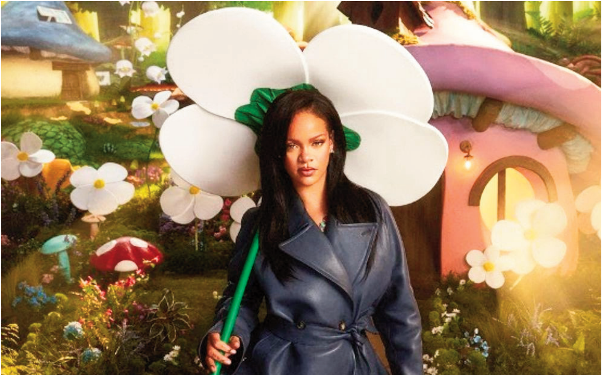
Rihanna is featured on the soundtrack of the new Smurfs movie