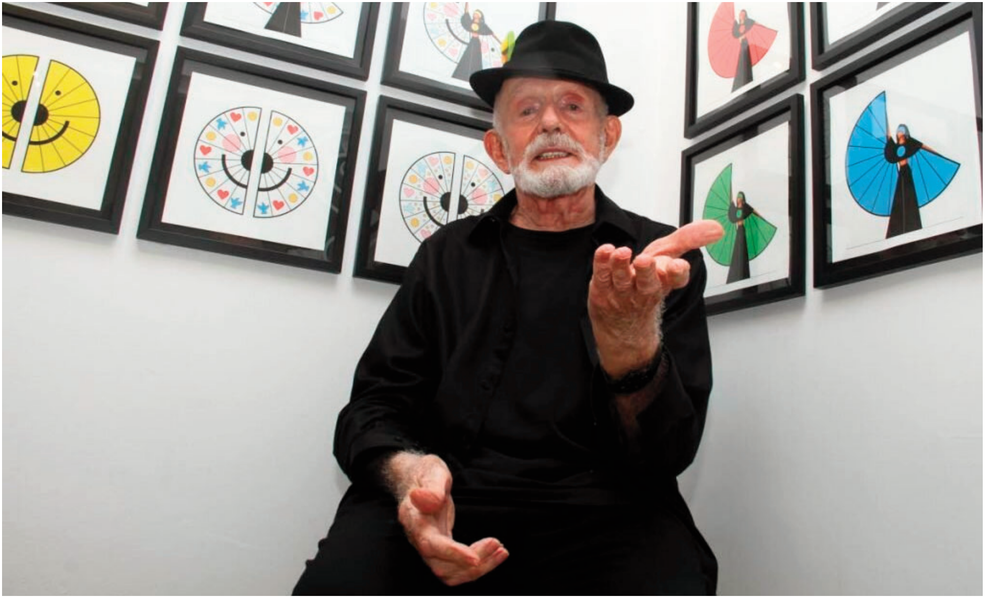
Peter Minshall — Guyana-born, Trinidad-raised artist has changed the face of traditional mas worldwide