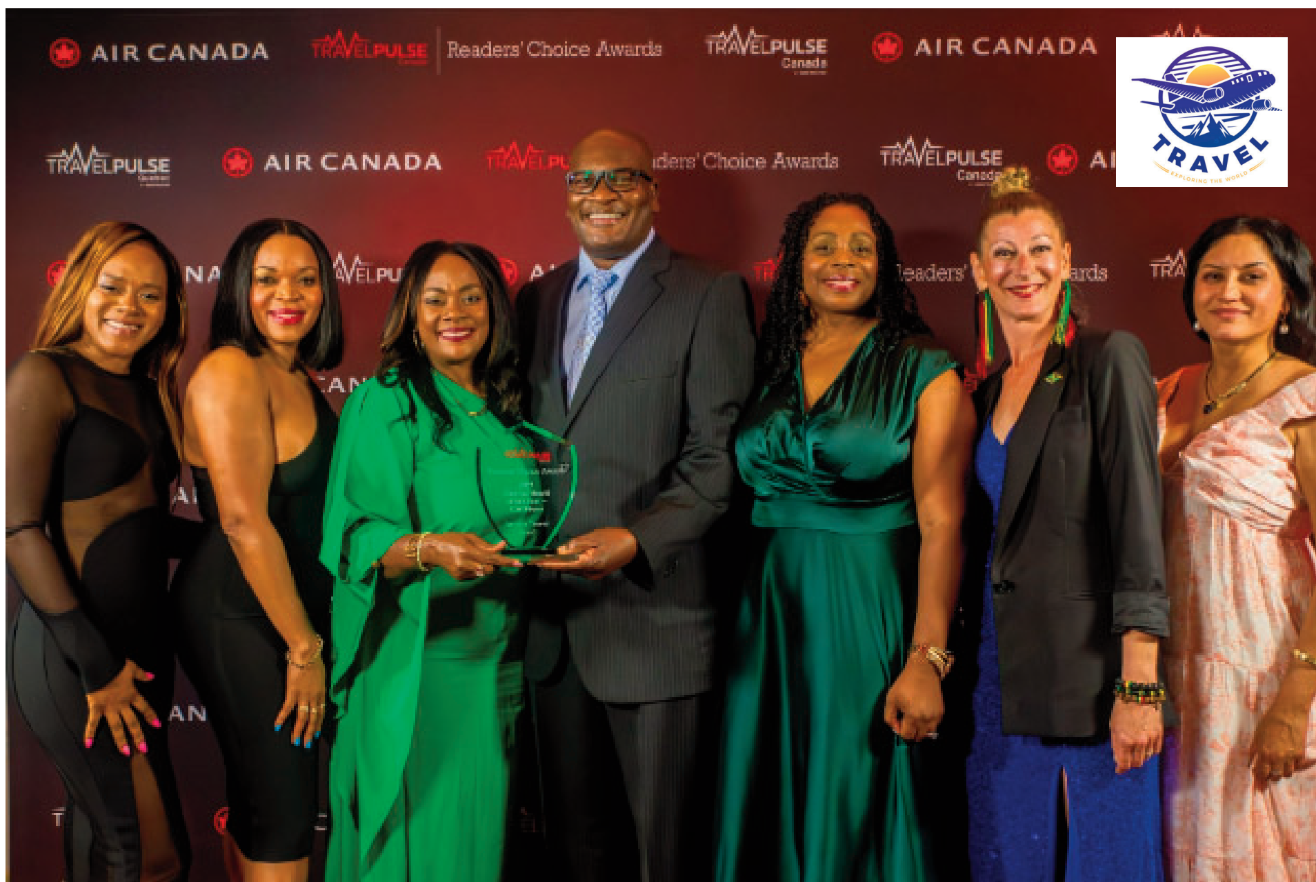
The Jamaica Tourist Board team received the award for Best Tourist Board – Caribbean and Best Destination - in Toronto