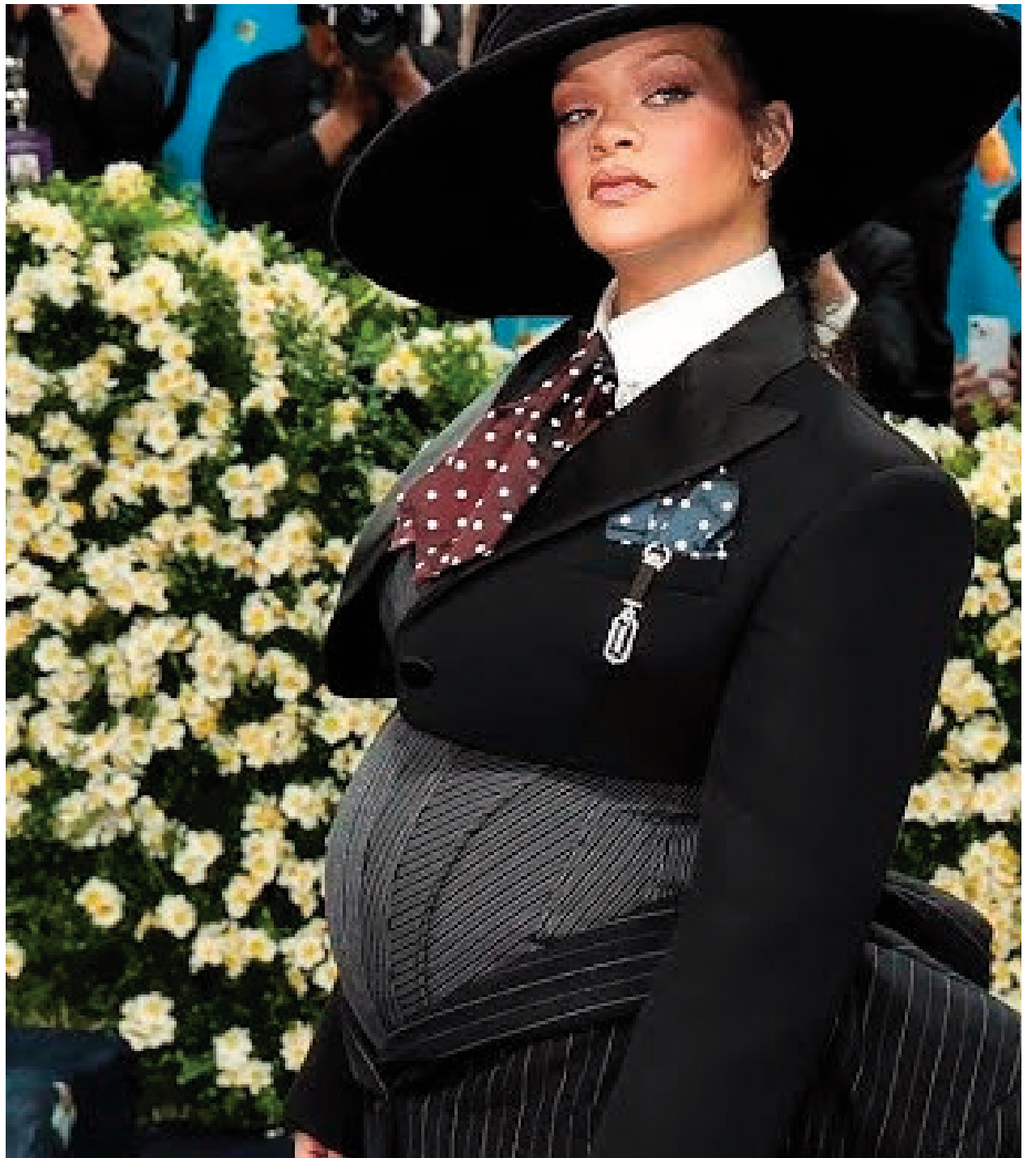
Rihanna at the Met Gala showing off her baby bump

A$AP Rocky also has Bajan roots. His father was born in Barbados, and Rocky has spoken in past interviews about visiting the island and being proud of his heritage.