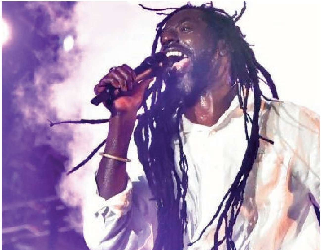
Buju Banton will headline the Rhythm and Soul Festival in Tobago on April 20th

Adding to the weekend’s allure, the Bucco Seafood Jazz experience on Saturday, April 19th,