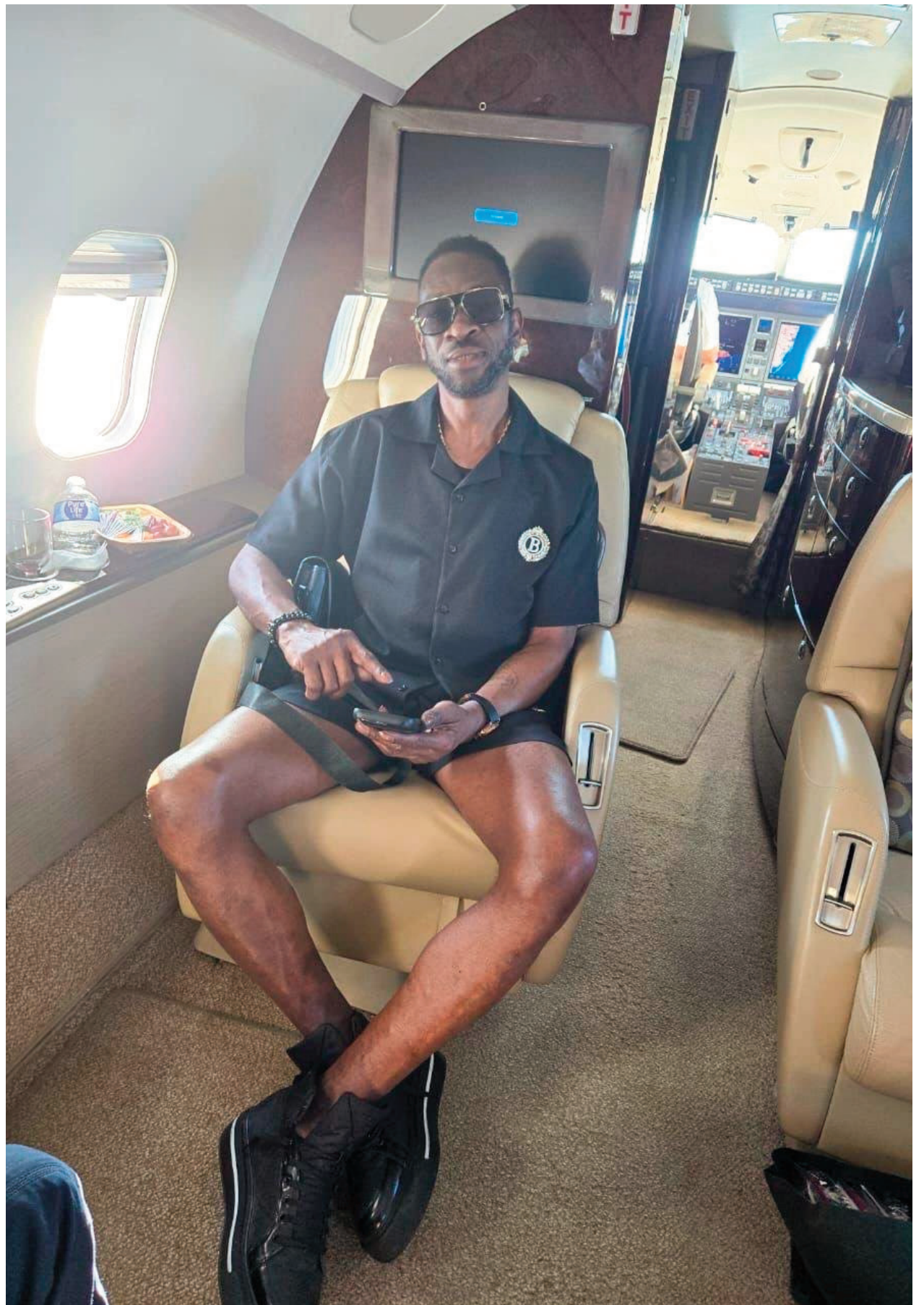
Flying in style: Bounty Killer on his private jet on his way to Miami

Moments after his arrival in Miami, Bounty Killer visited DJ Khaled at his estate, where the two are expected to lay down some new songs. "Fifteen years Bounty Killer hasn't been in the States in Miami in 15 years," Khaled said in a video of himself and the dancehall legend. "Warlord has return Miami unnu better come hire me," Killer said while laughing.