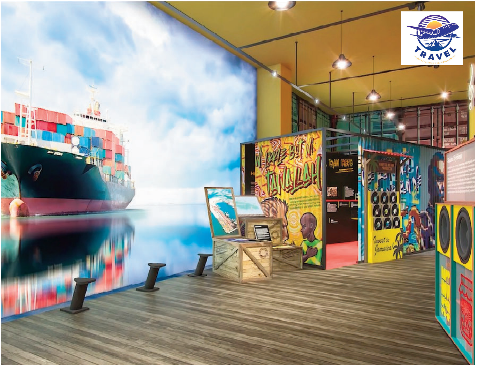
Jamaica had a very popular booth at the World Expo 2020 in Dubai