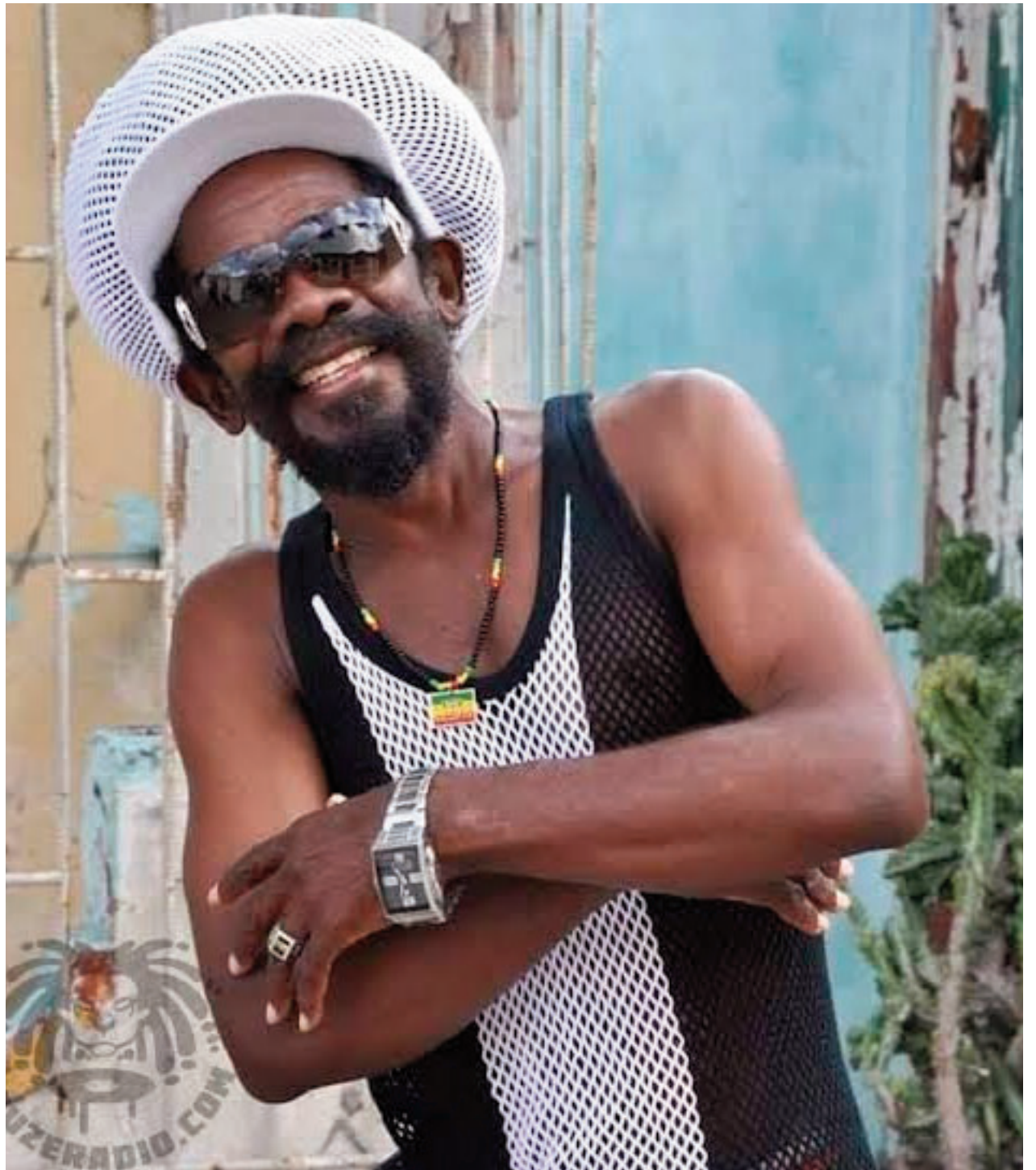
Cocoa Tea: performed at Barack Obama’s inauguration

ing, also paid tribute, saying, “Jamaica lost another musical icon. Cocoa Tea’s smooth vocals, timeless reggae songs, and presence in the global music scene have left a lasting impression on our culture.”