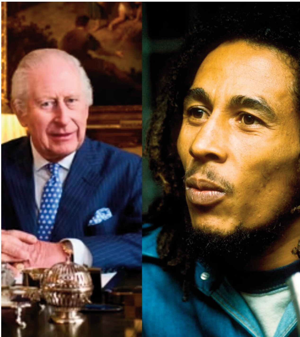
King Charles III and Bob Marley — met in London

Beyond reggae, The King’s Music Room explores Charles’ appreciation for other genres, from ska to jazz. He praised Jamaican-born singer Millie Small for her “unexpected gift [of] an extraordinary voice” on My Boy Lollipop and highlighted his admiration for Jamaican Grace