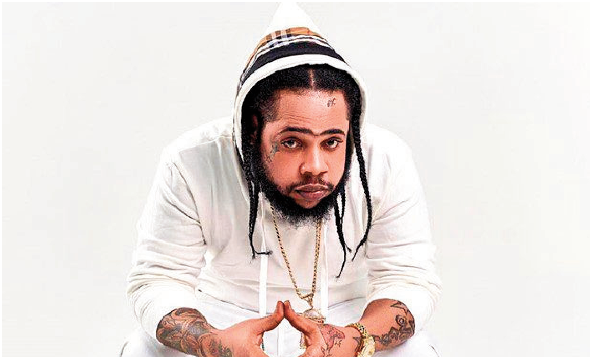
Squash was arrested on gun charges while in Florida