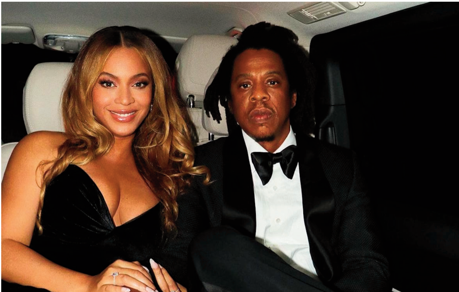
Beyonce and Jay-Z: targets of angry tweets from Kanye West