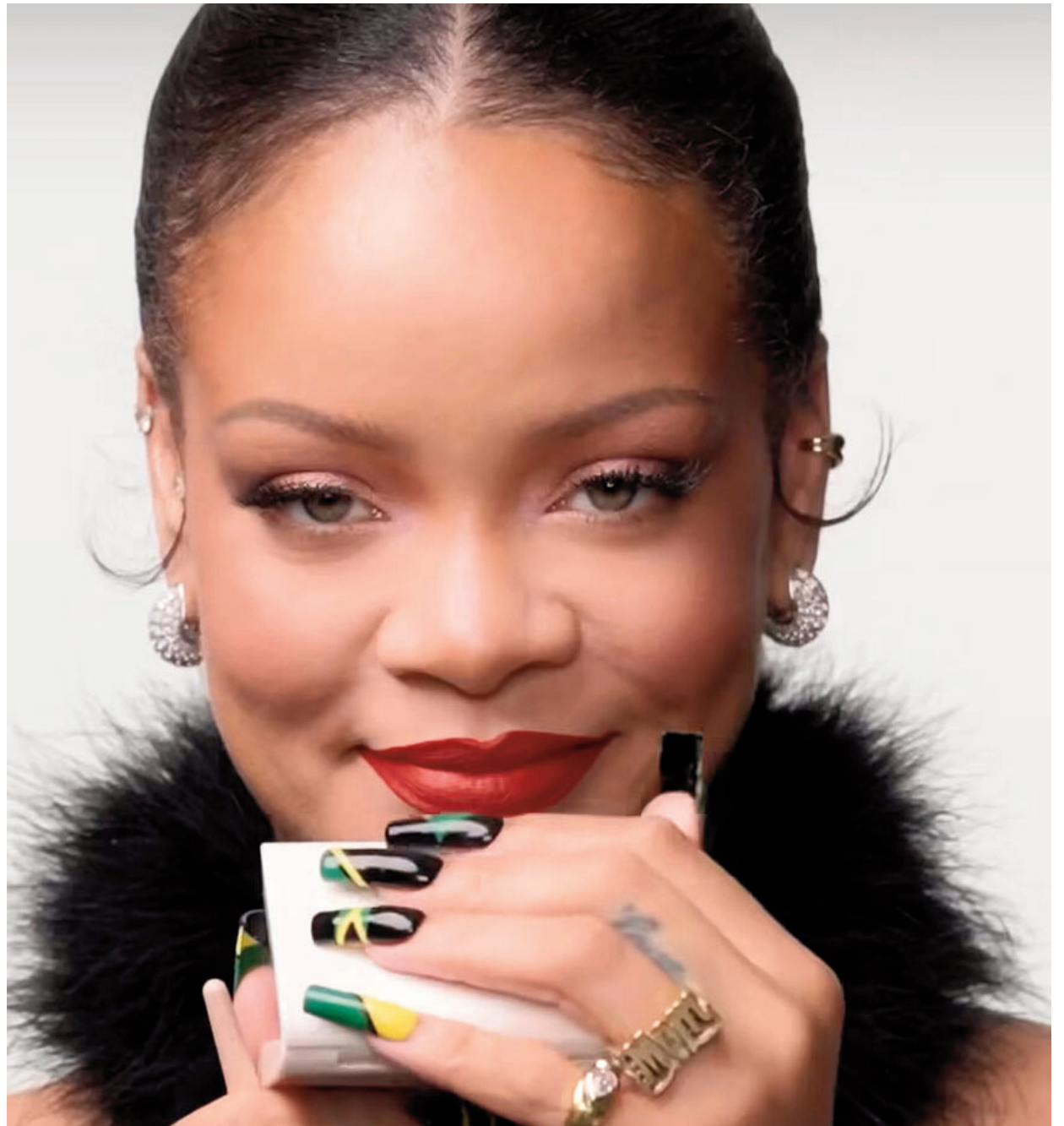
Rihanna in a clip from her Fenty Jamaica promo

Rihanna, however, reassured Jamaican fans that their time would come. “Coming home is always a pleasure and coming home for something like this is monumental,” she said during the Barbados launch. “And guess what? We bout to tear the rest of the Caribbean up. Everybody is waiting. Jamaica, I’m so sorry I’m not there yet, but I’m coming your way and you’re gonna have something special